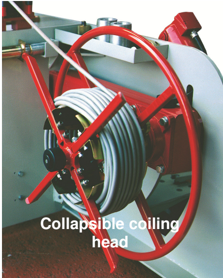
Collapsible coiling head